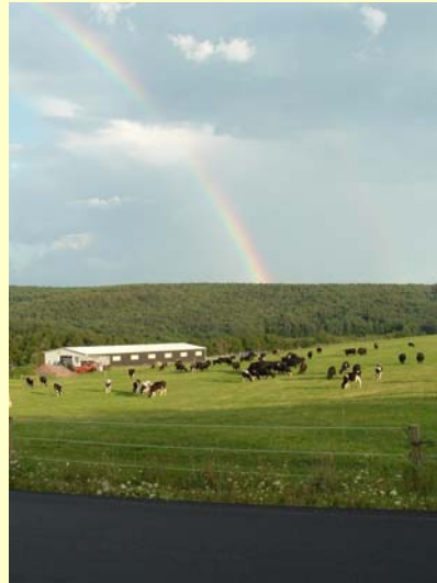
"This picture made the front cover of the Lancaster Farming paper this week. I've always wanted to get a good rainbow shot and this was it. This was taken over Endless Trails Farm in Hubbardsville, NY near the Headwaters of the Chesapeake Bay Watershed before a pasture walk at a nearby farm (Rocky top Acres)."