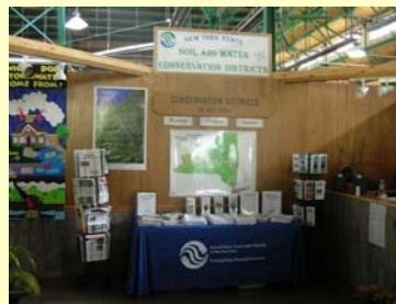
The 2009 NYSCDEA State Fair booth. Great job to the committee and all of the volunteers.