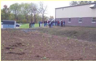
Municipal raingarden designed to treat 2.82 acres of drainage for a total treatment area of 8400 SQ FT.

The coalition is looking at possibly having a more stable funding source through a "pure waters fee." This is a fee, around $2.00 per parcel, to landowners for the development of a stormwater management districts. That figure is being looked at to determine if it is really equitable for all landowners. The collected funds will then go to county wide activities.