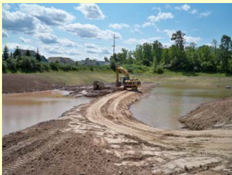
Good luck you two.

In order to have a successful stormwater program the District has maintained at least one CPESC on staff. Currently there are two CPESC's and Caroline and Kelly are studying up for their CPSWQ exam.